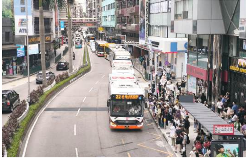
This file photo taken last month shows passengers waiting for public buses on Rua do Campo.

The statement added that screening measures will be adopted, as usual, to divert the flow of people in the areas with the highest concentration of tourists, between