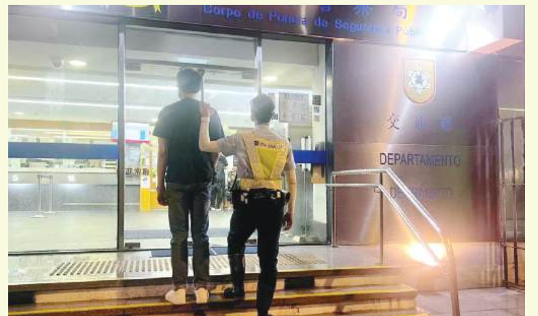
This undated photo provided by the Public Security Police (PSP) yesterday shows a PSP officer escorting the local hit-and-run suspect to the Traffic Police Headquarters.