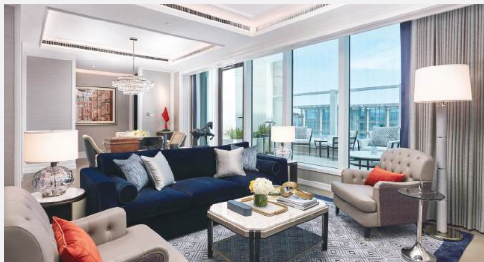
This undated handout photo provided by Sands China earlier this week shows the Londoner Grand's Grand Terrace Suite.

*Georgian architecture refers to the style of architecture that was prevalent in Britain and its colonies during the reigns of the first four British monarchs named George, from 1714 to 1830. Georgian architecture is known for its elegance and formality, and it has influenced many architectural styles in various parts of the world, especially in the US and Canada. — Source: Poe