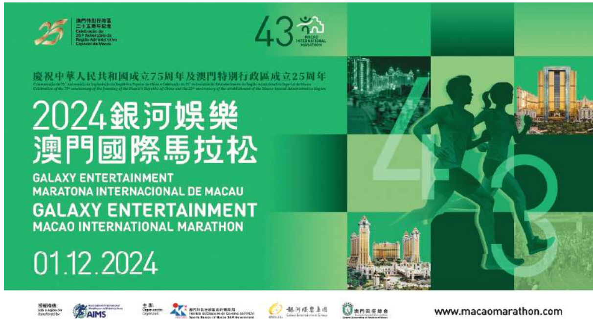
This poster provided by the Sports Bureau (ID) yesterday promotes the upcoming 2024 Galaxy Entertainment Macau International Marathon.

The races will start at the Olympic Sports Centre Stadium, with the marathon and half-marathon races starting at 6 a.m. and the mini-marathon race starting at 6:15 a.m. The marathon and half-marathon courses will cross the Governor Nobre de Carvalho Bridge (colloquially known as the old bridge) past the UNESCO World Heritage-listed A-Ma Temple and across Sai Van Bridge